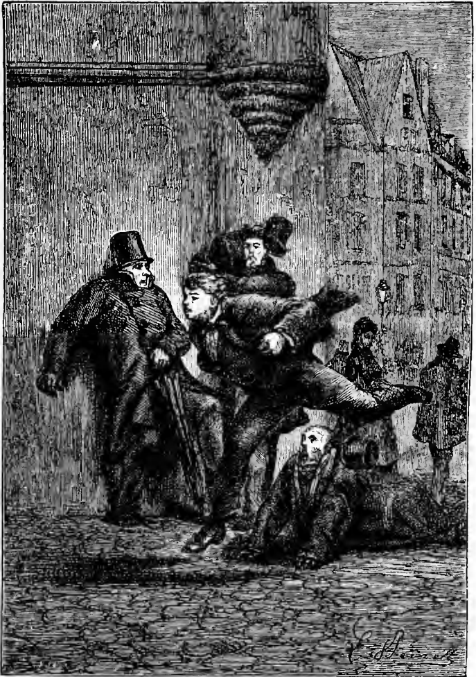
With dishevelled hair, hatless, running, running . . .